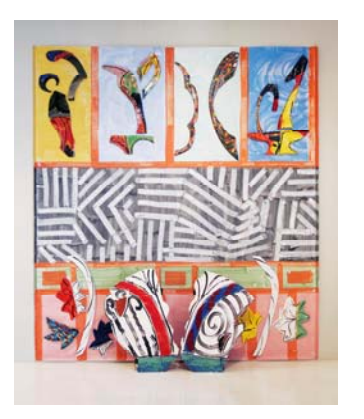
Betty Woodman, Ceramic Pictures of Roman Paintings: Internal Courtyard, 2007