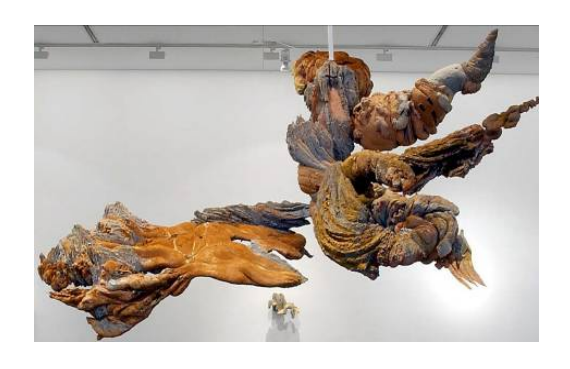
Charles Simonds, Mental Earth