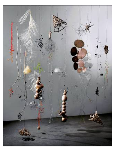
Judy Moonelis, Mirror Neuron Strands